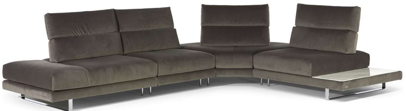
■ Vers. 763+753+673+755