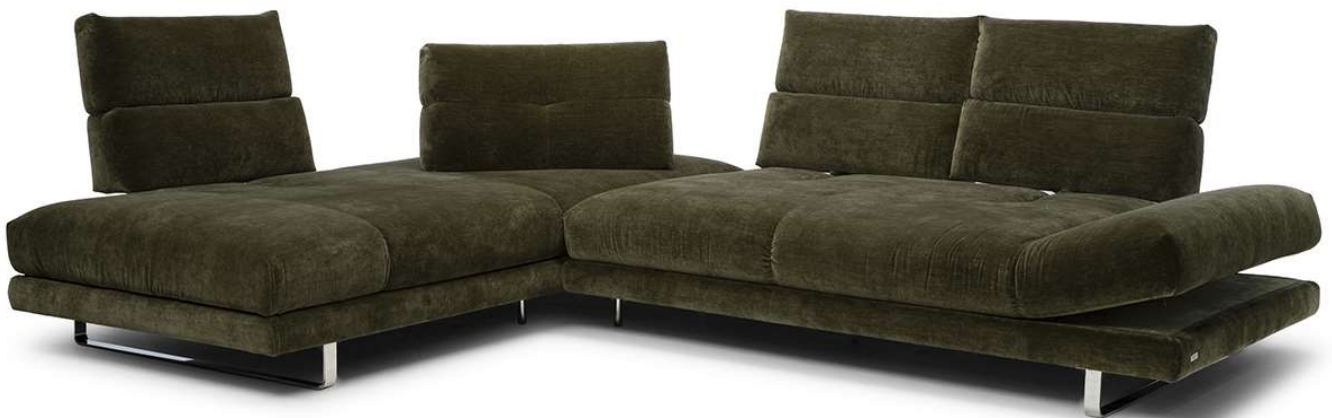
■ Vers. 765+436+769