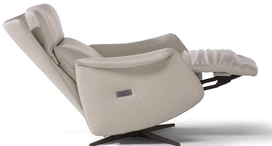
■ Vers. F44