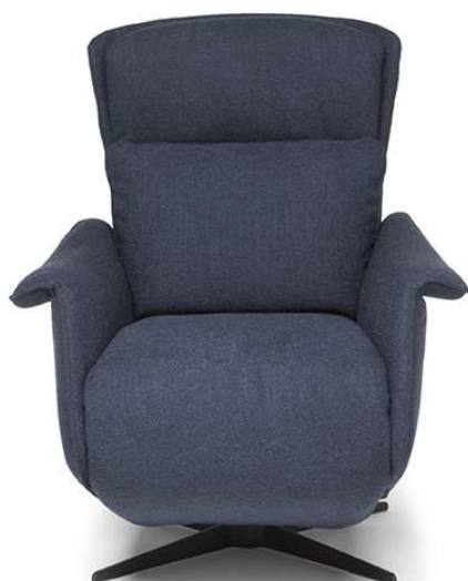
■ Vers. F45