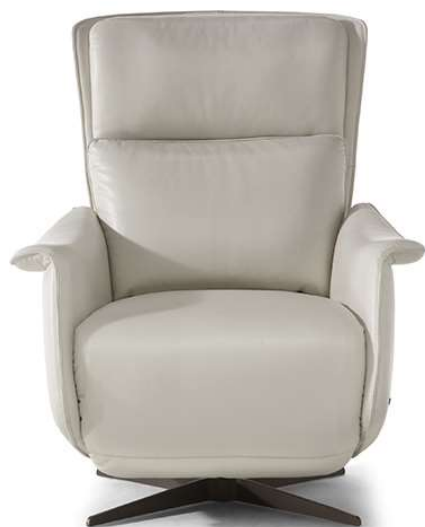
■ Vers. F44